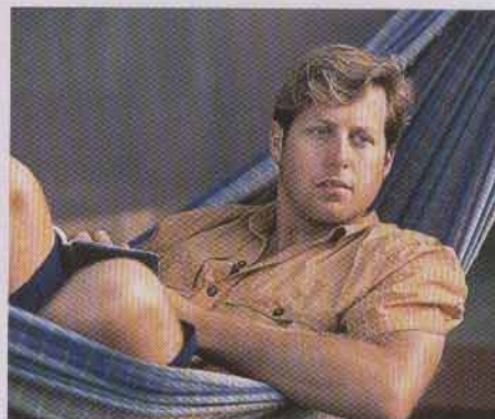
"WATCHING THE SUN RISE AND SET EVERY DAY HAD REBOOTED MY SYSTEM."