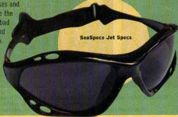
SeaSpecs Jet Specs

($169; other models $119 to $169; www.peakvisionsports.com)