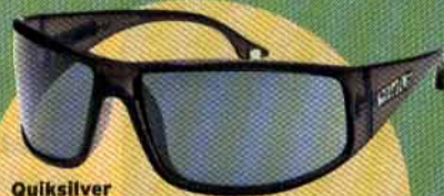
Quiksilver Akka Dakka