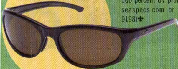
Smith Optics Sweetwater II

SeaSpecs Jet Specs ($59) Surfers, kayakers and kiteboarders will dig these JetSpecs with their polarized polycarbonate lenses and a built-in strap that'll make sure the shades stay put, no matter how bad you wipe out. Impact-resistant and 100 percent UV protection. (www.seaspecs.com or [305] 899-9198) †