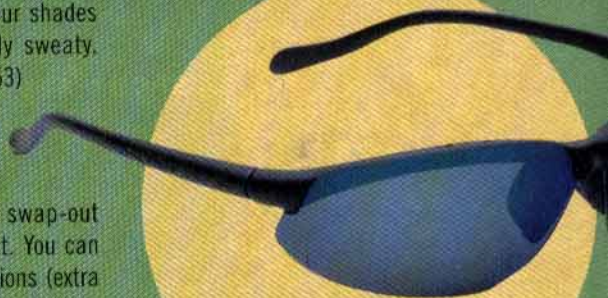
Native Dash XR

Zeal Blast ($90) Mountain bikers and roadies will dig the swap-out polycarbonate lenses of the Blast. You can pick the right lens for the conditions (extra lenses for $20 to $50). The patented anti-fog vented frame has interchangeable nose pads and a removable sweat guard for a truly customizable fit. Impact-resistant and 100 percent UV protection. ( www.zealoptics.com or [435] 259-6970)