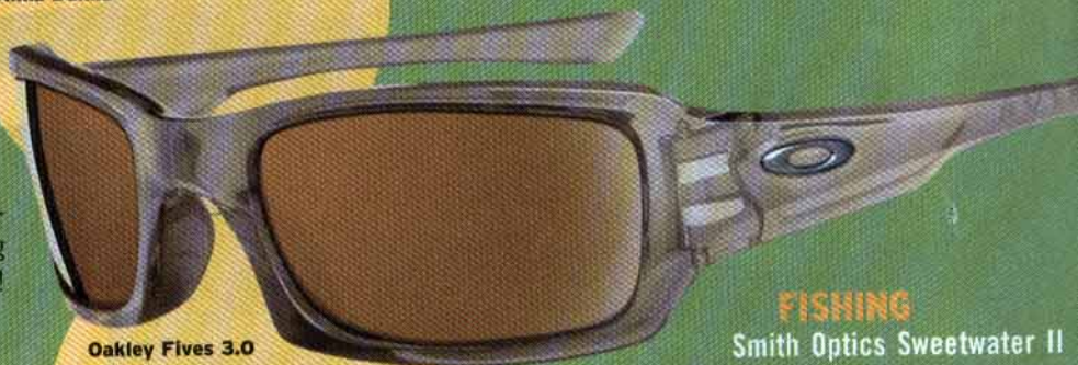
Oakley Fives 3.0