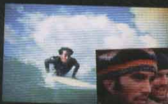
Screen grabs from Harper's new video, "Diamonds on the Inside"